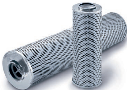
EXAPOR® AQUA filter elements

Simply the cooled down oil sample can be judged optically. As long as a turbidity is visible in the cooled down oil, the water content will be unacceptably high. If the cooled down oil sample appears clear, the water content usually lies in the permissible range. An exact measurement of the water content is made by an oil sample analysis in the laboratory (e.g. water content regulation after the Karl Fischer method in accordance with DIN 51777).