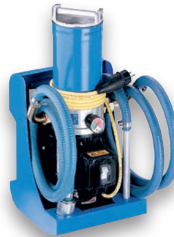
Filling unit FA 016

EXAPOR® AQUA filter elements are applicable in different ARGO-HYTOS filter units. Depending on the operating situation the water absorption amounts to approx. 1300 ml/element. The combination of water-