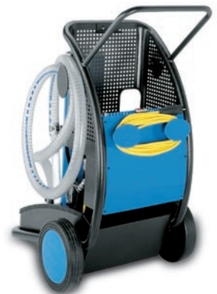
Oil service unit UM / UMP 045

absorbing filter layers with micro-filter material in the EXAPOR® AQUA also permits the use in hydraulic and lubrication systems with high requirements to the oil cleanliness.