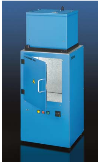
Sun simulation chamber UVACUBE 400

Alternative filters are available which can vary the spectrum to suit users needs.