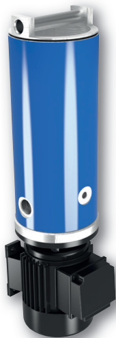
Off-line Filter Unit FNA 008/016