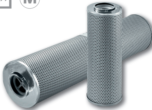
EXAPOR®AQUA Filter Elements