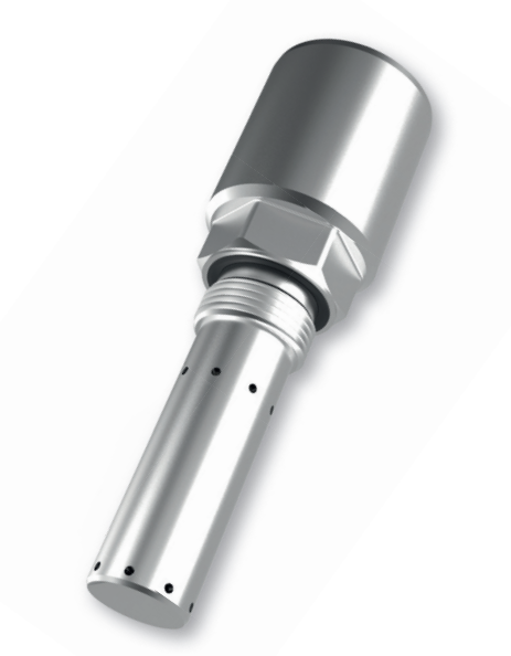
LubCos H₂O+ II