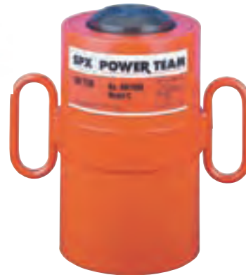
30, 60, 100 Ton Double-Acting Models Feature Threaded Collar