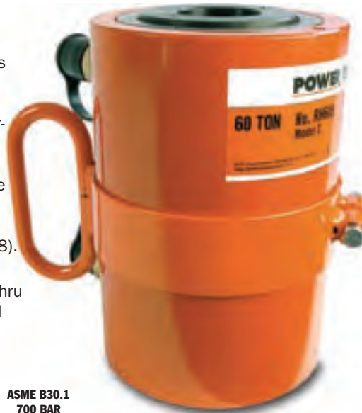
ASME B30.1 700 BAR