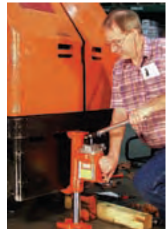
The J Series Toe Jack is an extremely rugged jack used here for lift truck service.