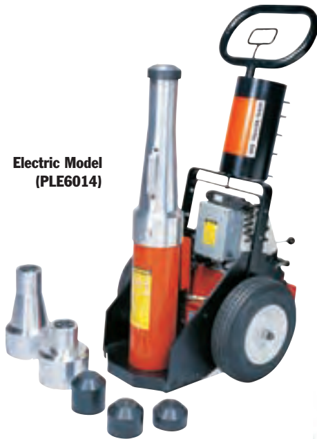
Electric Model (PLE6014)