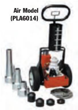
Air Model (PLA6014)